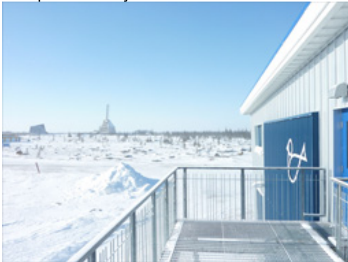
Outside Observation Deck

The Churchill Northern Studies Centre was founded in 1976 and is an independent, non-profit research and education facility. They provide housing, logistical, workspace, and equipment for scientific researchers working on a range of topics of interest to northern science. The building is situated along the Hudson Bay seacoast and is seeking LEED certification for its low environmental impact construction and operation.