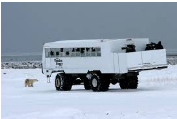
a typical tundra vehicle

(The schedule for van and bear buggy are to be determined and may not occur in the order stated above)