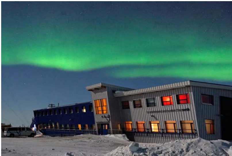
The Churchill Northern Studies Centre