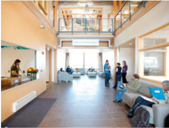
Reception / Lobby